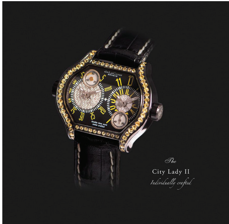
The City Lady II Individually crafted